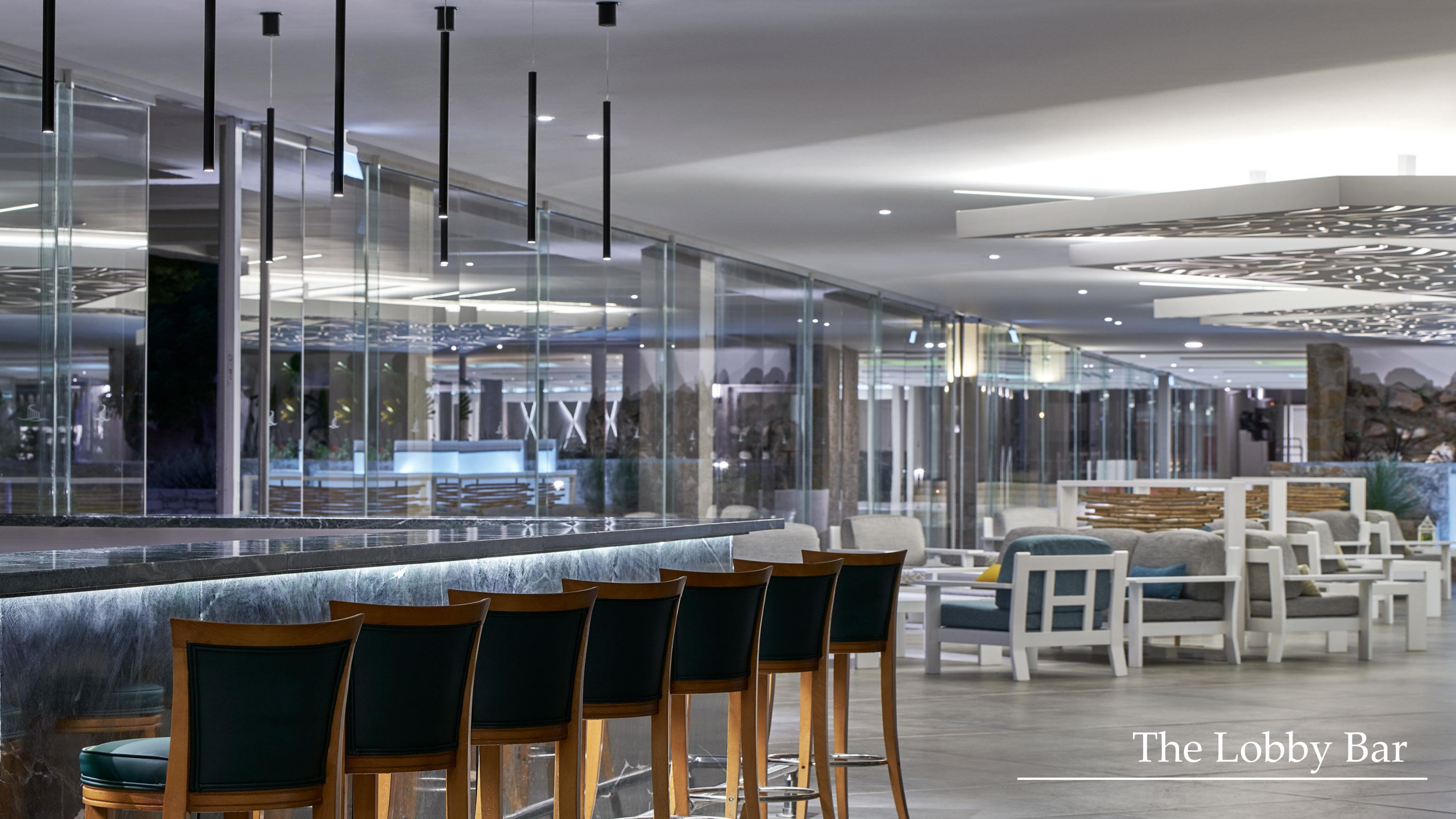
The Lobby Bar